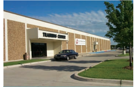
Training Center @ Lemley Memorial Campus 3420 S. Memorial