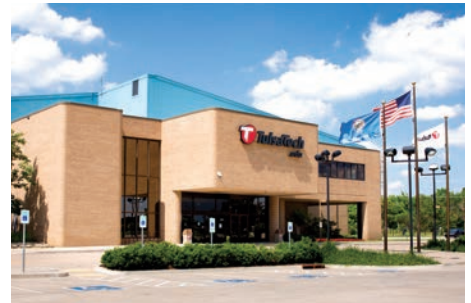
Peoria Campus 3850 N. Peoria