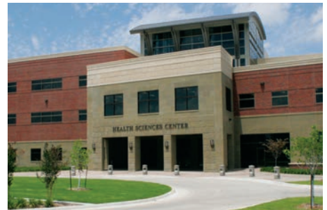
Health Sciences Center @ Lemley Memorial Campus 3420 S. Memorial